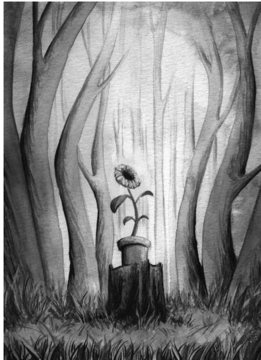
2010 artwork by Tanya Pshenychny

Art in the Park Committee Galesburg Civic Art Center 114 East Main Street Galesburg, IL 61401