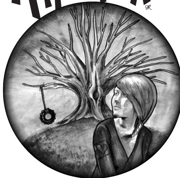
2009 artwork by Josh Dixon

Art in the Park Committee Galesburg Civic Art Center 114 East Main Street Galesburg, IL 61401